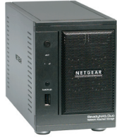
Convenient, small size for desktop use (~ 6 x 4 x 9 in)