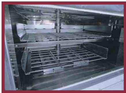
Split deck - two turntables within the one baking chamber

This compact oven can be used to produce an extensive range of bakery products. Various models are available and range in size from 4 to 12 tray capacity. All are supplied with glass doors, internal lighting and inbuilt steaming systems. The split deck option provides double the tray capacity within the one baking chamber.