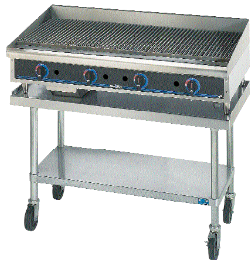
Model 6048CBD with Optional Equipment Stand and Casters