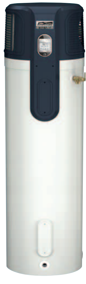
HPE6280H045DV Model Shown

*For complete warranty information consult the written warranty of American Water Heaters found at www.americanwaterheater.com , or call (800) 456-9805.