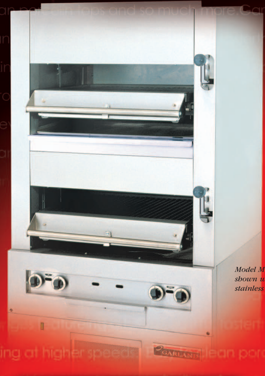
Model M110XM, shown with optional stainless steel sides

In the US: Garland Commercial Industries, Inc. 1-800-424-2411 In Canada: Garland Commercial Ranges, Limited 1-888-442-7526 www.garland-group.com