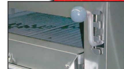
New offset rack adjustment handle design keeps the handle, and your hand, out of the heat zone.

New rack handle design and placement ensures the handle is out of the path of infra-red rays. The handle stays cool-to-the-touch enhancing ease of use and operator safety.