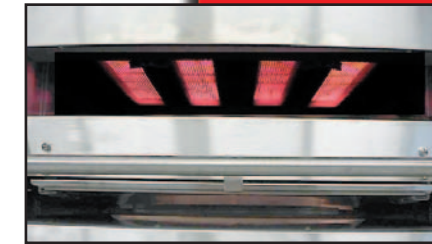
High-performance, infra-red burners

2 Enclosed broiling chambers and efficient use of infrared heat result in a cooler working space around the new M110XM. Cooler, more comfortable employees will be happier, more productive, and more efficient!