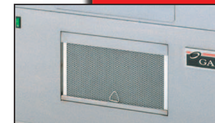
Easy to clean, removable air filter.

Redesigned, filtered combustion airflow features filters that are front-mounted far away from the broiling chambers for safe, easy removal and cleaning. Regular maintenance is fast and simple.