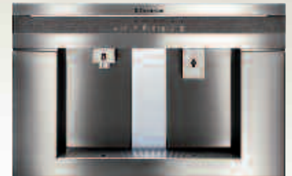
EIW60002 Compact Integrated Refreshment Centre