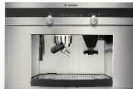
EBA60010X Semi Automatic Integrated Coffee Machine - Great Italian style espresso coffee at home.