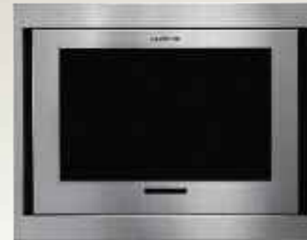
ETV45000 Integrated LCD TV