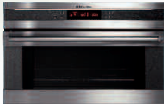
EOK66030 Compact Oven with Grill