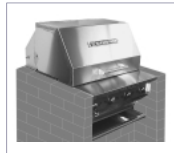
Model CBBQ-30-BI — with roll-top hood