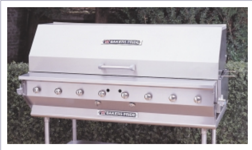
Model CBBQ-60 — with optional 60" roll-top hood

The Ultimate Outdoor Char Broilers are designed for broiling, grilling, steaming, roasting and holding — all in a single piece of equipment.