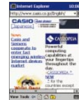
Pocket Internet Explorer