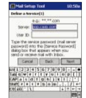
Mail Setup Tool & Mail Setup Manager for CASSIOPEIA

Eliminates troublesome e-mail setup operations by simply following the wizard display.