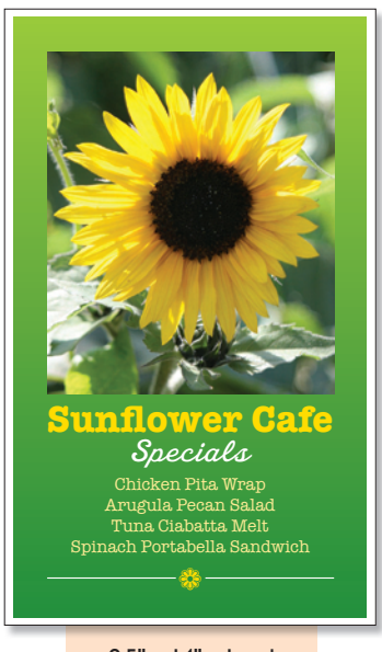
8.5" x 14" - Legal