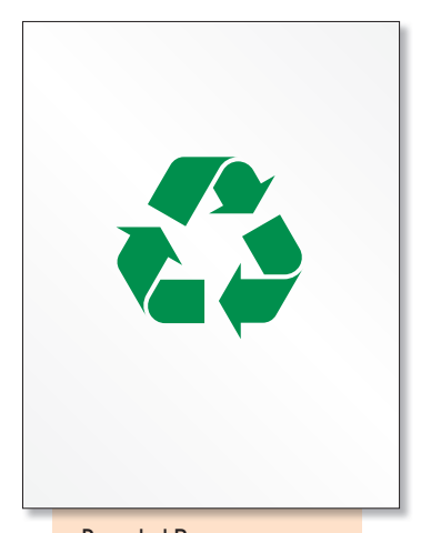
Recycled Paper The MFX-C3035 delivers exceptional output results when using recycled papers featuring 30%, 50% and 100% post consumer recycled content.