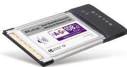
Dual-Band Wireless A+G Notebook Network Card (F6D3010)