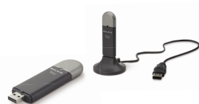
Dual-Band Wireless A+G USB Network Adapter* (F6D3050)