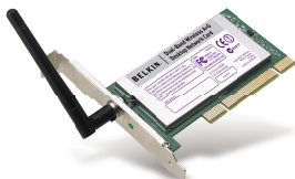
Dual-Band Wireless A+G Desktop Network Card (F6D3000)