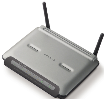
Dual-Band Wireless A+G Router (F6D3230-4)