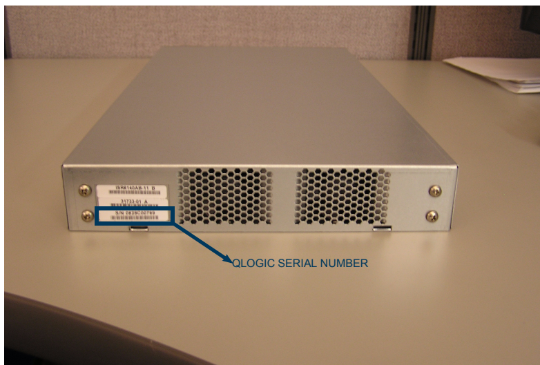
Figure 3. mpx100 Without Plenum (Do Not Use this Serial Number)