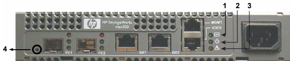
Figure 1 shows the LEDs and maintenance button.

To reset the router and restore it to the factory default configuration, use a pointed, nonmetallic tool to press and hold the maintenance button until the heartbeat LED flashes 20 times, then release the button. The router boots and is restored to the factory defaults. The boot time is less than one minute.