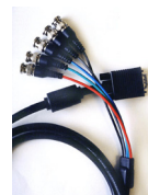
HD-15 Cable (Not Supplied)