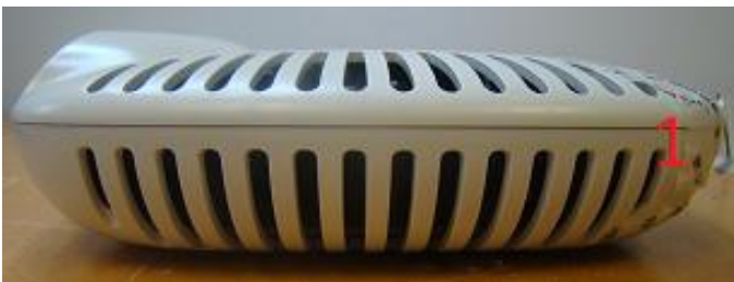
Figure 3: AP-134 Left View