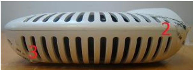
Figure 5: AP-134 Right View