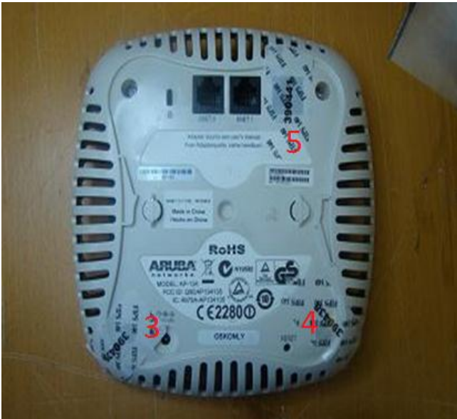
Figure 6: AP-134 Bottom View