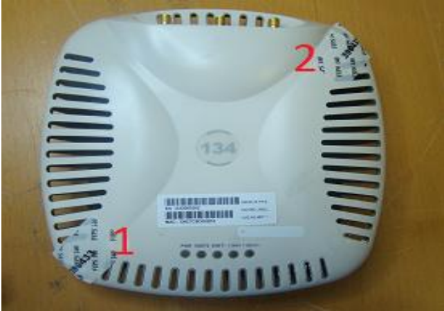
Figure 4: AP-134 Top View