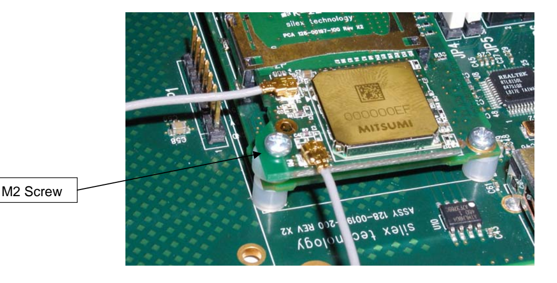
Figure 3. Securing the SX-SDCAG