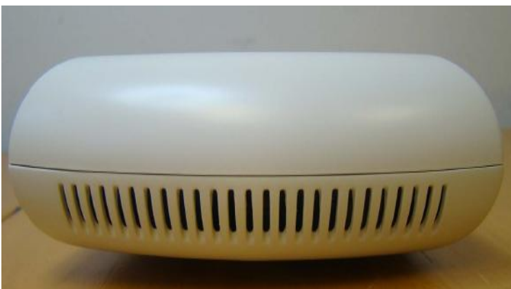
Figure 15 - Aruba AP-105 Tel placement front view

Following is the TEL placement for the AP-105: