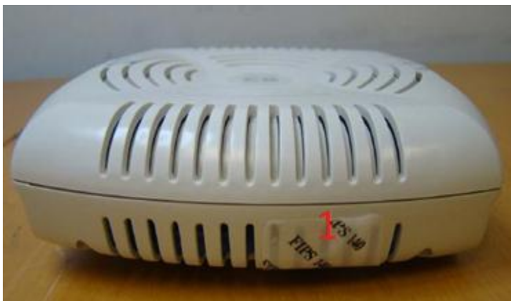
Figure 10 - Aruba AP-93 Tel placement front view

Following is the TEL placement for the AP-93: