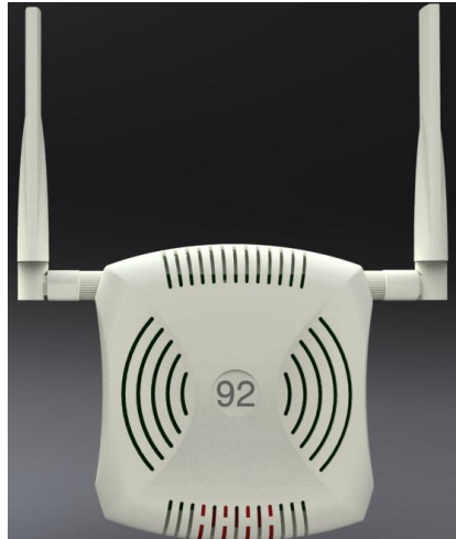
Figure 1 - AP-92 Wireless Access Point

The Aruba AP-92 is robust-performance 802.11n (2x2:2) MIMO, single radio supporting 2.4 GHz or 5 GHz (802.11a/ b/g/n), indoor wireless access points capable of delivering wireless data rates of up to 300Mbps. This multi-function access point provides wireless LAN access, air monitoring, and wireless intrusion detection and prevention. The access point works in conjunction with Aruba Mobility Controllers to deliver high-speed, secure user-centric network services in education, enterprise, finance, government, healthcare, and retail applications.