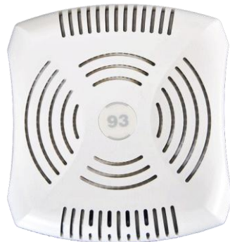
Figure 2 - AP-93 Wireless Access Point

The Aruba AP-93 is robust-performance 802.11n (2x2:2) MIMO, single radio supporting 2.4 GHz or 5 GHz (802.11a/ b/g/n), indoor wireless access points capable of delivering wireless data rates of up to 300Mbps. This multi-function access point provides wireless LAN access, air monitoring, and wireless intrusion detection and prevention. The access point works in conjunction with Aruba Mobility Controllers to deliver high-speed, secure user-centric network services in education, enterprise, finance, government, healthcare, and retail applications.