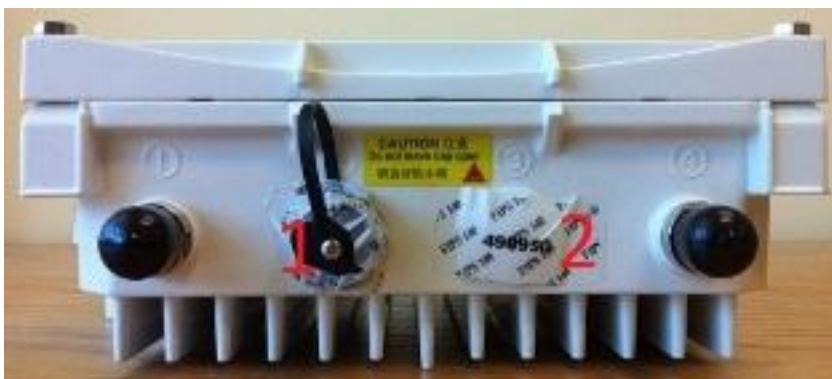
Figure 19 - Aruba AP-175 Tel placement front view

Following is the TEL placement for the AP-175: