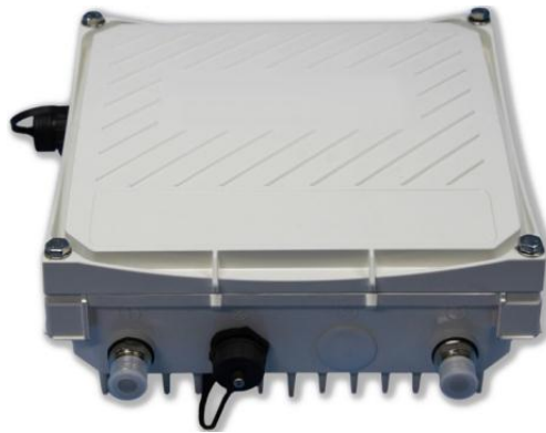
Figure 4 - AP-175 Wireless Access Point

The Aruba AP-175 is high-performance 802.11n (2x2:2) MIMO, dual-radio (concurrent 802.11a/n + b/g/n) indoor wireless access points capable of delivering combined wireless data rates of up to 600Mbps. This multi-function access point provides wireless LAN access, air monitoring, and wireless intrusion detection and prevention over the 2.4GHz and 5GHz RF spectrum. The multifunction AP-175 is an affordable, fully hardened outdoor 802.11n access point (AP) that provides maximum deployment flexibility in high-density campuses, storage yards, warehouses, container/transportation facilities, extreme industrial production areas and other harsh environments.