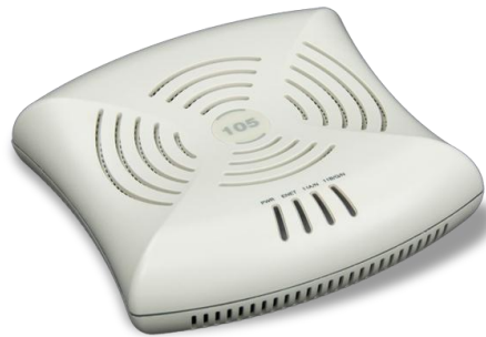
Figure 3 - AP-105 Wireless Access Point

The Aruba AP-105 is high-performance 802.11n (2x2:2) MIMO, dual-radio (concurrent 802.11a/n + b/g/n) indoor wireless access points capable of delivering combined wireless data rates of up to 600Mbps. This multi-function access point provides wireless LAN access, air monitoring, and wireless intrusion detection and prevention over the 2.4GHz and 5GHz RF spectrum. The access point works in conjunction with Aruba Mobility Controllers to deliver high-speed, secure user-centric network services in education, enterprise, finance, government, healthcare, and retail applications.