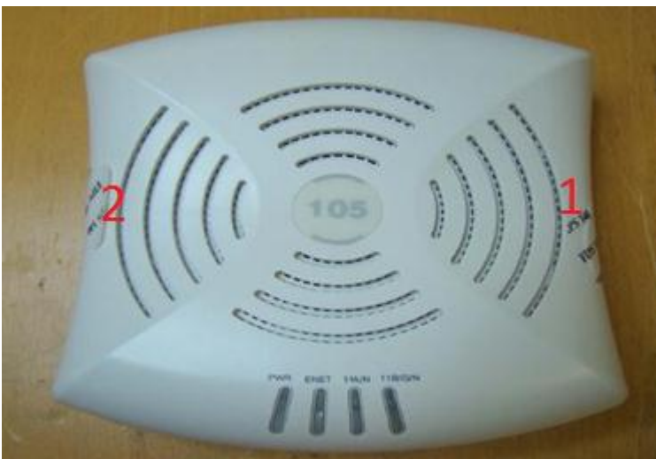
Figure 18 - Aruba AP-105 Tel placement top view