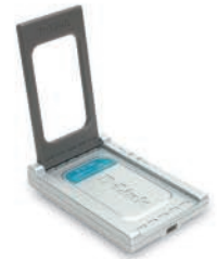
DWL-G120 802.11g/2.4GHz Wireless USB Adapter

Other D-Link products that work with the DWL-G630: