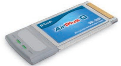
DWL-G630 Wireless Cardbus Adapter

The DWL-G630 is a powerful 32-bit cardbus adapter that installs quickly and easily into laptop PCs and when used with other D-Link AirPlus™ G products will automatically connect to the network out of the box.