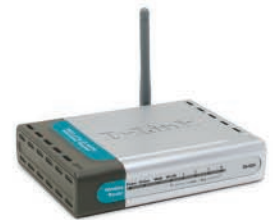
DI-524 802.11g/2.4GHz Wireless Router