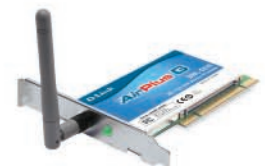
DWL-G510 802.11g/2.4GHz Wireless PCI Adapter