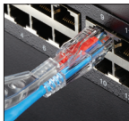
Figure 3. Release the tool from the clip.

Insert the tip of the Removal Tool under the Locking Pin.