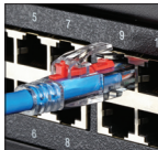
Figure 1. Insert the red locking clip.

Locking Pins for TAA-Compliant GigaTrue® 3 Patch Cables, Slimline, Lockable, version 2