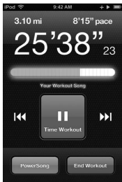
iPhone 3G S and iPod touch

Nike + iPod automatically gives you spoken feedback on your progress during your workout (see “Getting Spoken Feedback” on page 15). You can also get feedback whenever you want it.