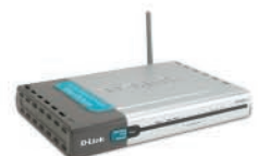
DI-824VUP Wireless G