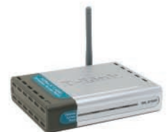
DWL-G700AP Wireless G Access Point DP-G310