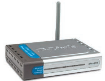
DWL-G710 Wireless G Range Extender

The DWL-G710 is fully compatible with all IEEE 802.11g devices and is backward compatible to 802.11b. This means all 802.11b-compliant wireless devices can still communicate with your DWL-G710.