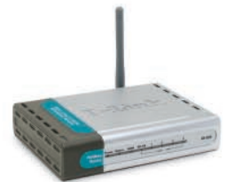
DI-524 Wireless G Router

Other D-Link Products work with DWL-G710: