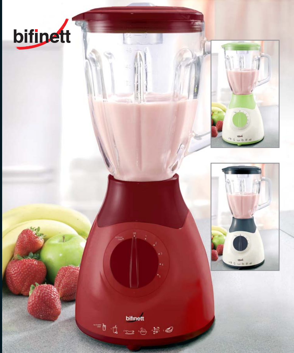
GB Blender KH 526 Instruction Booklet