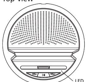
▶ Press or press and hold to turn on the unit; press and hold to turn off the unit

VOL-/VOL+ – Press to decrease or increase volume