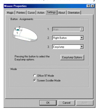
Figure 2. Mouse Properties Window

Button Swap: assign the right button to be the primary mouse button for left-handed use, or revert to the factory setting.