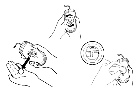
Figure 4. Removing and cleaning the mouse ball

To remove the software driver from your hard disk, click the Start menu, select Programs , select the scroller mini mouse driver, and click Uninstall .