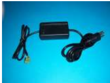
FIGURE 2: PSACV1 Power Supply