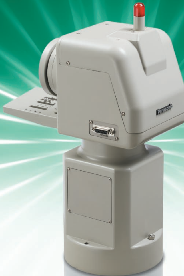
Example of use with HD AK-HC1500