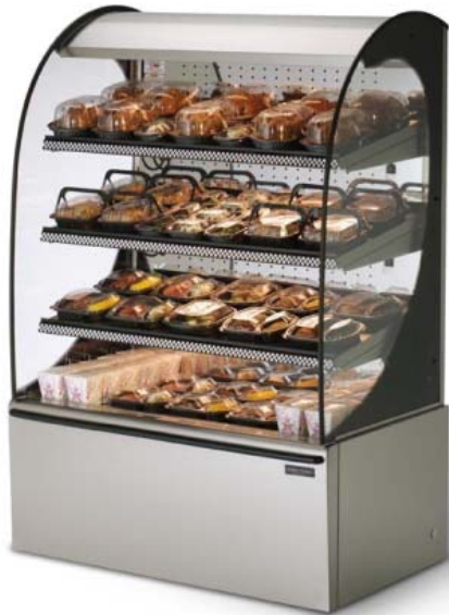
Hot express case, model HEC-104 with three angled shelves and lower deck.