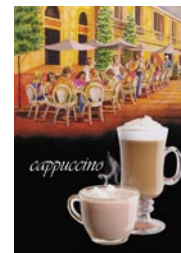
Model FMD-3 available with optional Cafe Display

Dimensions: 30"H x 11.3"W x 23.3"D (76.2 cm H x 28.7 cm W x 59.2 cm D)