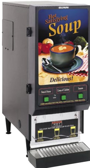
FMDS-3 front display panel

Dimensions: 30"H x 11.3"W x 23.3"D (76.2 cm H x 28.7 cm W x 59.2 cm D)