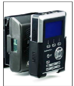
ABWMK-HD100 & DR-HD100

POWERTAP-FS4 – provides power to the DR-HD100 hard disk drive from the Gold Mount battery, via a special 14" PowerTap cable.