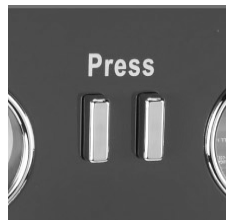
Botón para oprimir