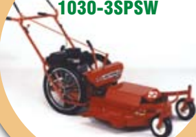
Model 1026-3SPSW 1030-3SPSW

26" or 30" Cut, Powerful 11.5 HP Briggs, Side Discharge, 20" HD-Spoke Wheels, HD-Tires w/ Sealed HD Precision Ball Bearing, Dual Front Swivel Wheels, Plow Style Handles, Quick Height Adjustment, Self-propelled, 3 Speed Peerless Transmission, All Sealed Ball Bearings.