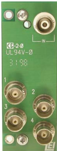
REAR CELL 1025 RGB

Height: ..... 3.2 Inches Width: ..... 1 Inch Length: ..... 10 Inches Weight: ..... 8 Oz.