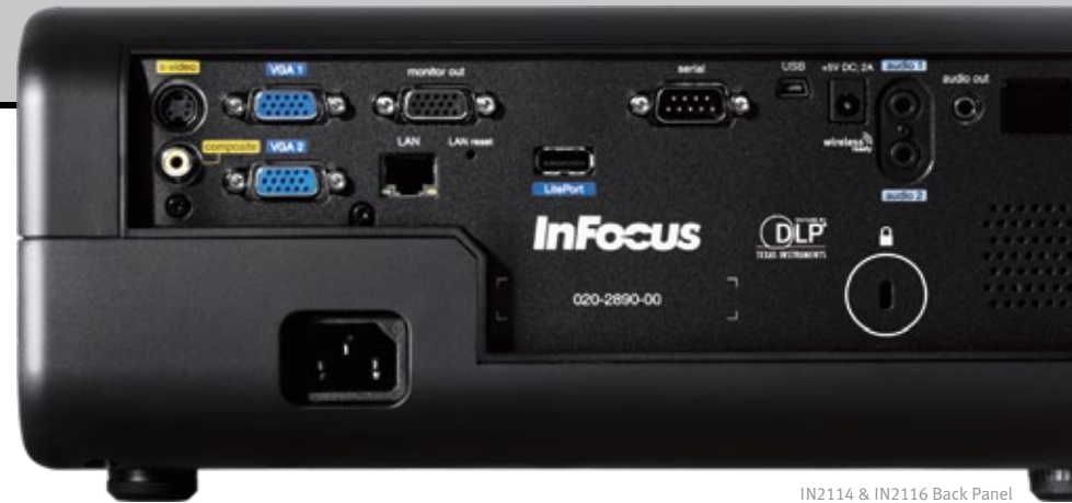
IN2114 & IN2116 Back Panel