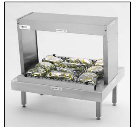
SW-2418 Sandwich Warmer

Merco Savory, LLC 1111 North Hadley Road Fort Wayne, Indiana 46804 United States of America Technical Support Hotline: (800) 678-9511 Telephone: (260) 459-8200 www.mercosavory.com