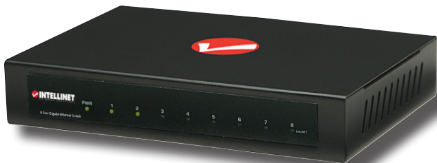
Shown: Model 530347, 8-Port