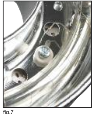
N.B. Always replace with the correct flashtube assembly.