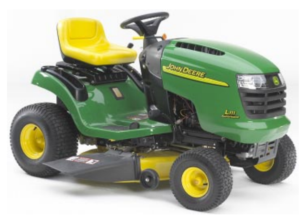
L111 Hydrostatic Drive Lawn Tractor, 20 Horsepower and 42-in. Mower Deck