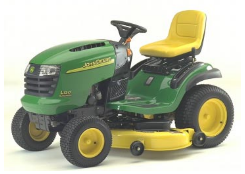
L130 Hydrostatic Drive Deluxe Lawn Tractor, 23 Horsepower and 48-in. Mower Deck