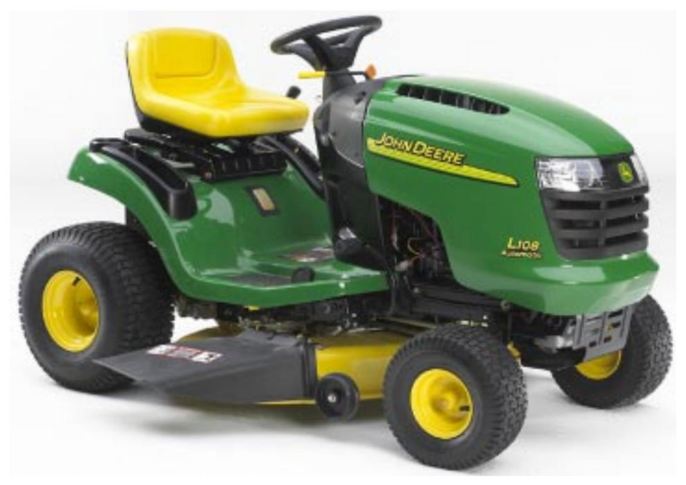
L108 Hydrostatic Drive Lawn Tractor, 18.5 Horsepower and 42-in. Mower Deck