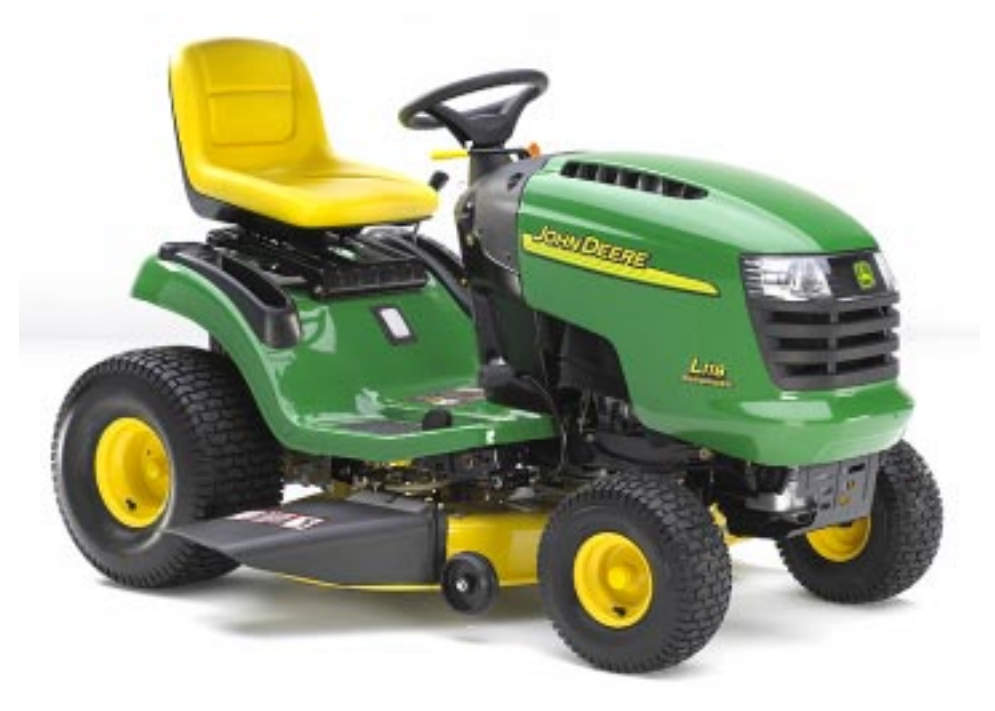
L118 Hydrostatic Drive Lawn Tractor, 22 Horsepower and 42-in. Mower Deck