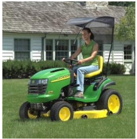
L130 Lawn Tractor shown with optional Sun Canopy

The John Deere L Series Lawn Tractors are recommended for value-conscious homeowners who mow up to: