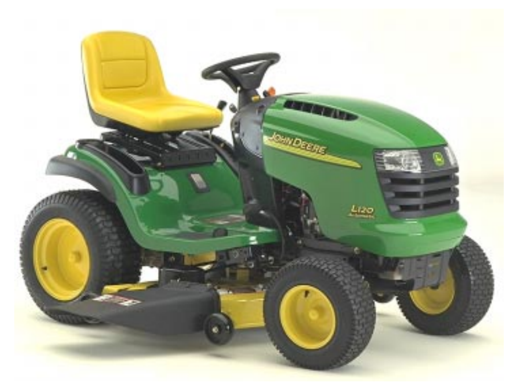
L120 Hydrostatic Drive Deluxe Lawn Tractor, 22 Horsepower and 48-in. Mower Deck