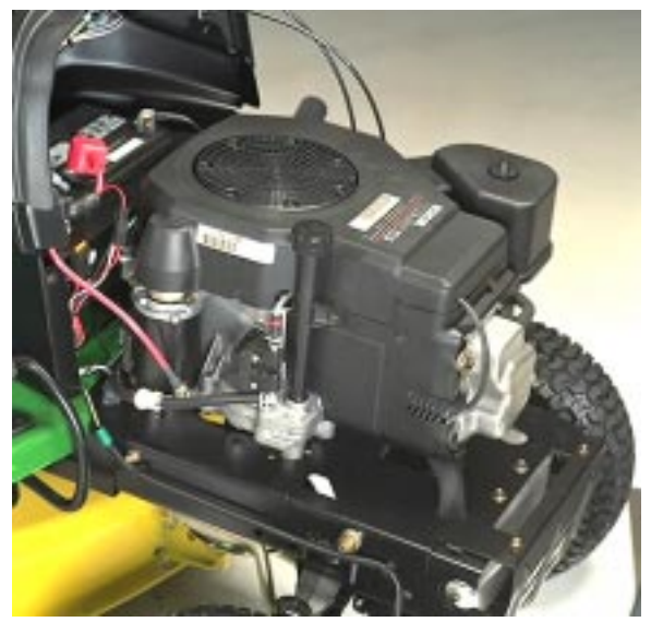
L110 17.5 horsepower Kohler engine shown

The John Deere L Series Lawn Tractors use Briggs & Stratton and Kohler engines. These engines provide plenty of power and torque to handle tough mulching, mowing, and bagging conditions.