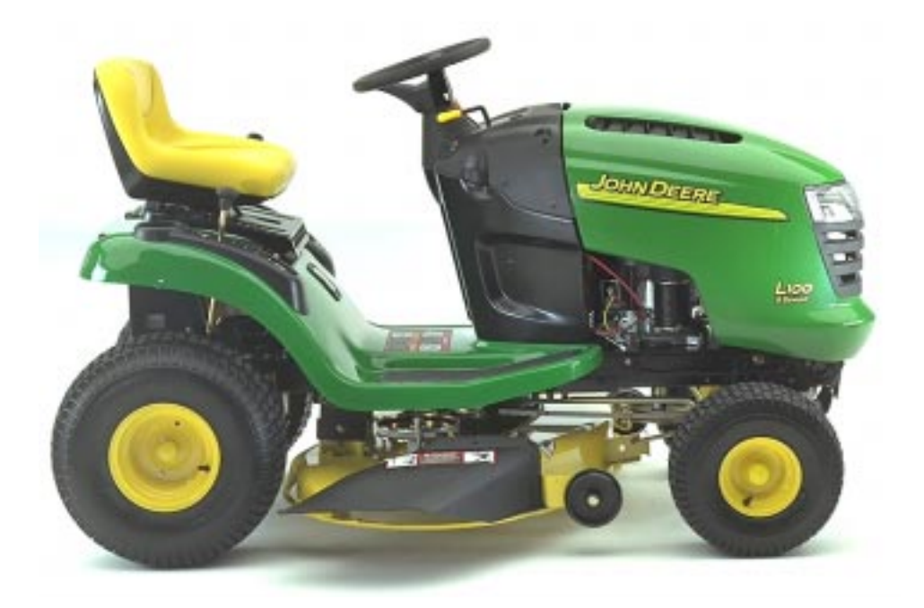
L100 5-Speed Gear Drive Lawn Tractor, 17 Horsepower and 42-in. Mower Deck