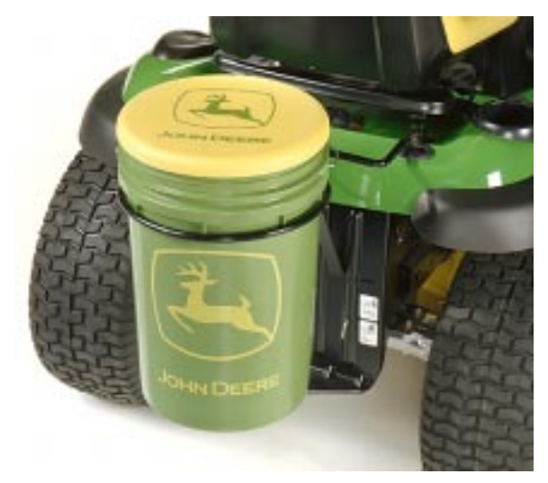
Note: Bucket is not included with CargO Mount bucket holder.

The new CargO Mount<sup>™</sup> bucket holder makes transporting mulch, plants, or debris easier with any L100 Series Lawn Tractor or G110 Garden Tractor.