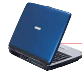
The A60 series