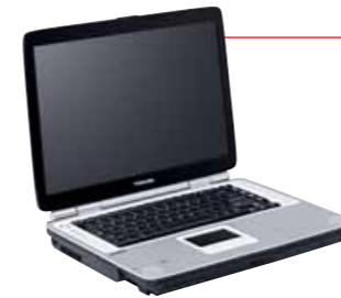
The P10 series