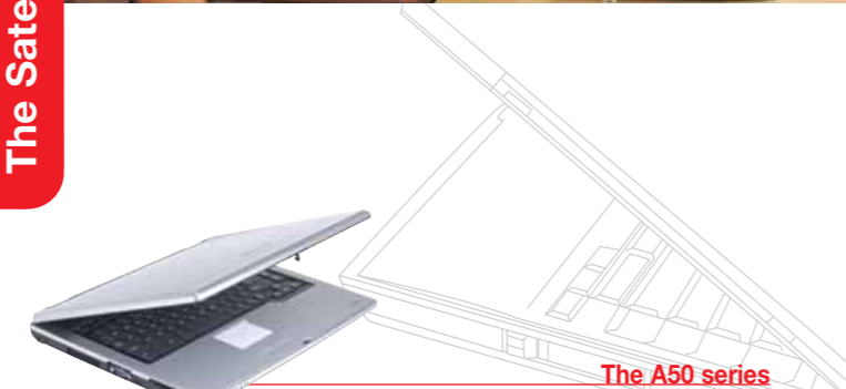
The A50 series

Easy does it The latest software applications offer instant out-of-the-box enjoyment and productivity. A host of practical features ensure the best possible user experience.