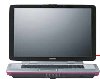
The P20 series