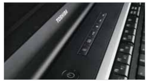
The Toshiba Multimedia Bar gives you the most spontaneous access to all your multimedia needs.

A big screen doesn't have to mean a big price. The Satellite L350 is the ideal 17" widescreen laptop for people who want a combination of large impact and affordability. With this basic all-round laptop you get Toshiba's quality, style and full performance so you don't have to compromise on the essentials. Toshiba's latest innovative EasyMedia features are also included in order to make your digital life the way it should be: easy and effortless.