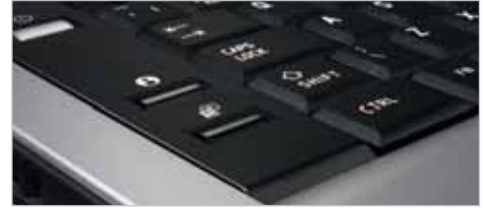
Toshiba Assist and Presentation Button: instantly launch tools and presentations