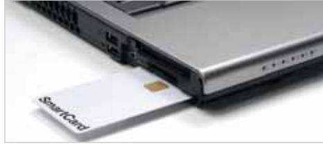
SmartCard Reader: enhanced security of systems and information through smart-card login features