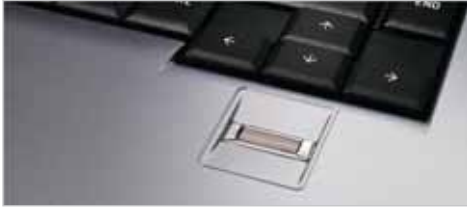
Fingerprint Reader: secure and convenient single touch sign-on