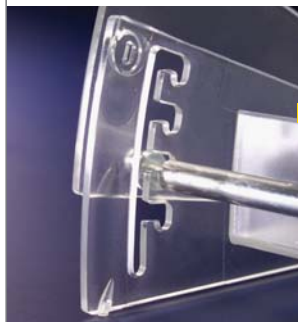
■ Five possible height settings