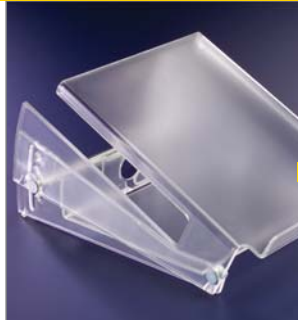
■ Integral document holder

Recent studies in Sweden and the Netherlands show that working with the Ergo-Q results in significant improved body posture, more comfort, less musculoskeletal pain and injuries and higher productivity.