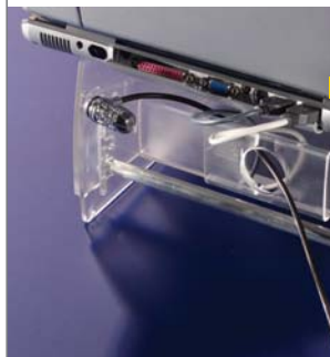
■ Ultra-portable; includes own carrying case