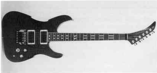
VANDENBERG® QUILT-TOP MODEL

WARNING: TO PREVENT ELECTRICAL SHOCK OR FIRE HAZARD, DO NOT EXPOSE THIS APPLIANCE TO RAIN OR MOISTURE. BEFORE USING THIS APPLIANCE, READ BACK COVER FOR FURTHER WARNINGS.