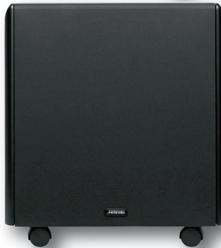
SW5500 subwoofer above, shown with front grille removed, and SW1600 below.

Meridian's SW1600 and SW5500 combine the finest materials with state-of-the-art design to create what we believe are the ultimate subwoofers, emphasising extreme bass, depth, clarity, control, and articulation.