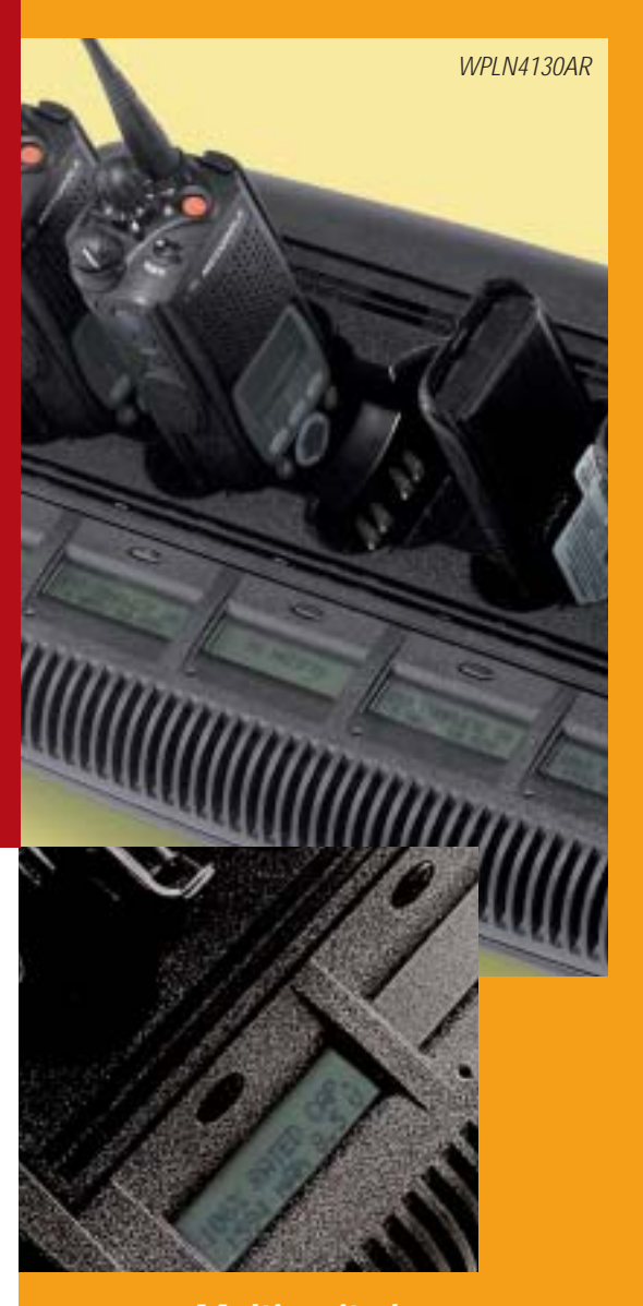
Multi-unit charger with battery analyzer features.