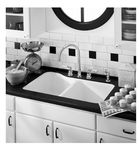
Undercounter Mount Installation (faucet not included)