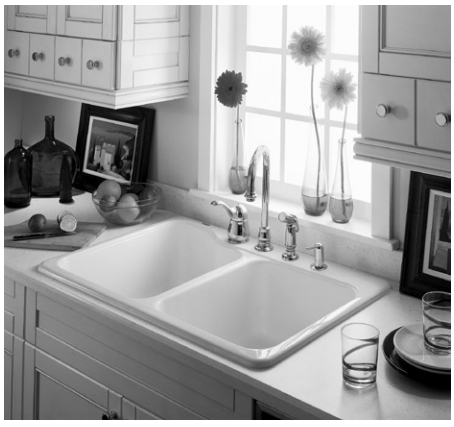
Top Mount Installation (faucet & soap dispenser not included)

SEE REVERSE SIDE FOR ROUGHING-IN DIMENSIONS