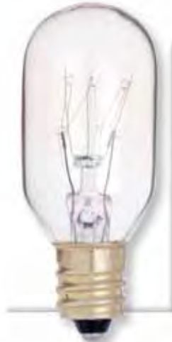
Appliance Bulb S3905 15 Watt Cand. Base/130 Volt Dom. Code #15T7C