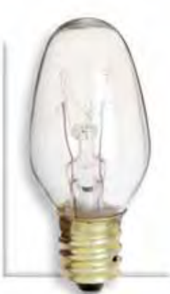
Night Light S3902 7 Watt Cand. Base/130 Volt Dom. Code #7C7 S3903 10 Watt Cand. Base/130 Volt Dom. Code #10C7