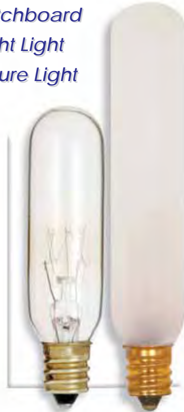
Switchboard Bulb S3910 15 Watt Cand. Base/130 Volt Dom. Code #15T6 S3912 15 Watt Cand. Base/145 Volt Dom. Code #15T6 S3315 15 Watt Cand. Base/120 Volt Dom. Code #15T6/F

Packing: 10 Pack Sleeve 120/Master, 10/Inner