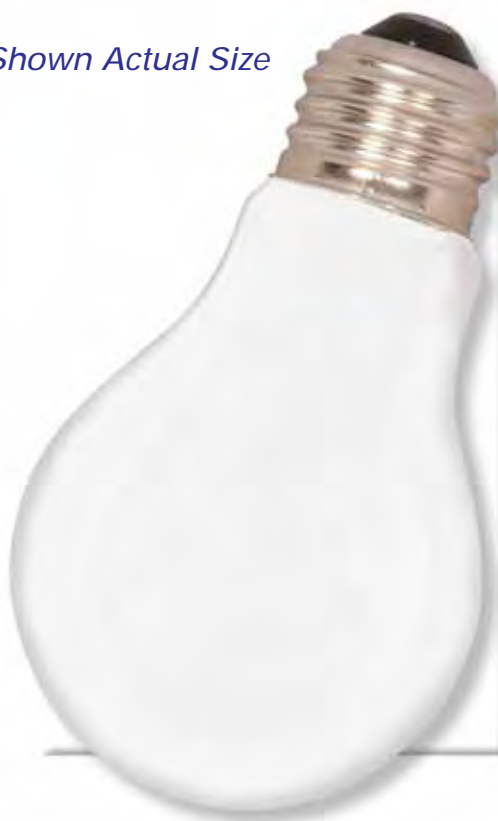
Energy Saver 120 Volt

Packing: Boxed, 4 Pack, 48/Master, 12 4-Packs