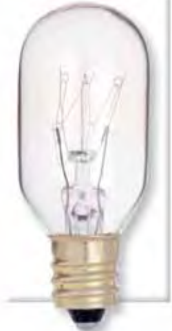
Indicator Bulb S3907 25 Watt Cand. Base/130 Volt Dom. Code #25T8C