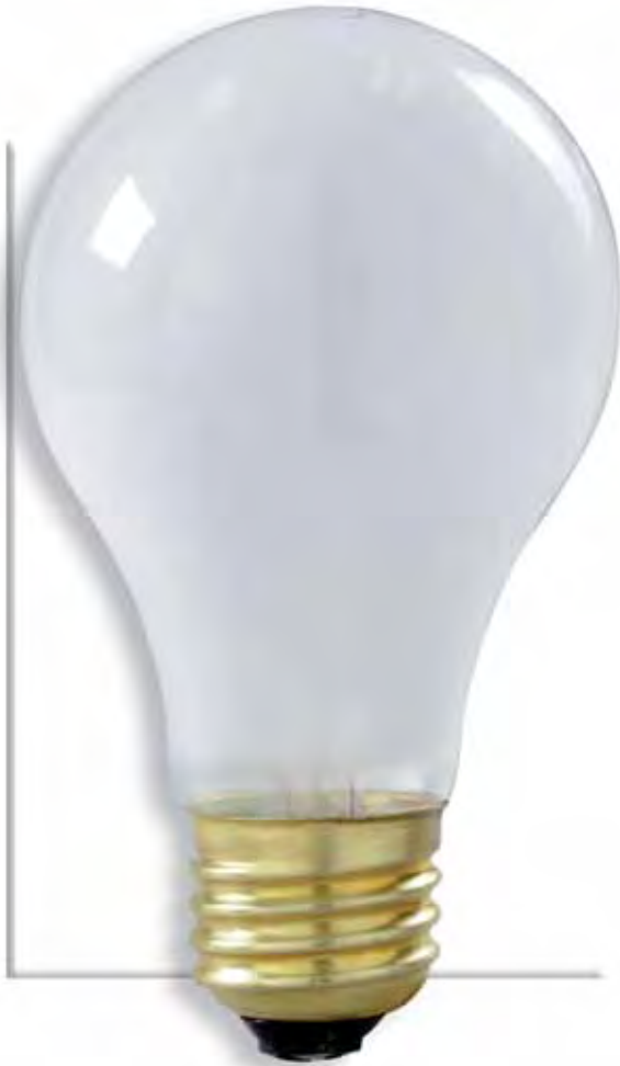
Long Life Commercial Service

Frosted S3934 75 Watt A21 Medium Base S3935 100 Watt A21 S3936 100 Watt A23