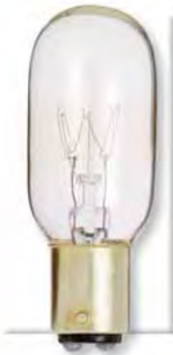
Indicator Bulb S3906 15 Watt D.C. Bay. Base/130 Volt Dom. Code #15T7/DC