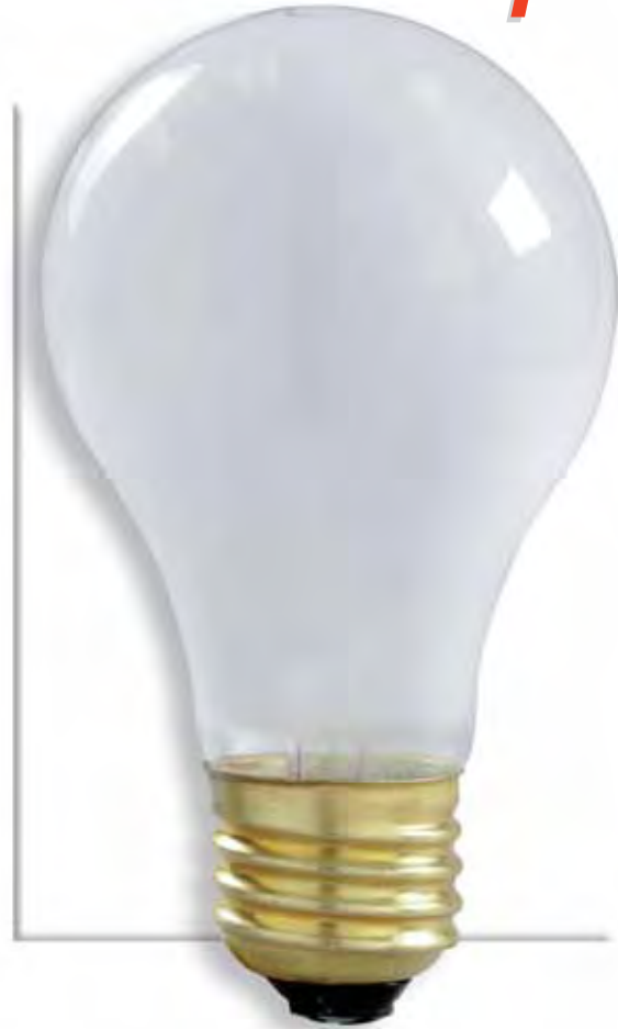
Left Hand Thread A19