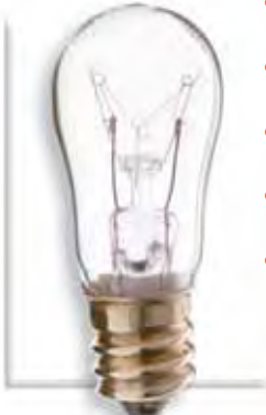
Indicator Bulb S3900 6 Watt Cand. Base 130 Volt Dom. Code #6S6