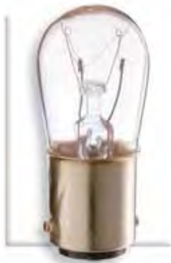
Appliance Bulb S3901 6 Watt D.C. Bay. Base 130 Volt Dom. Code #6S6DC