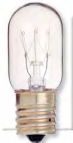
Indicator Bulb S3911 15 Watt Int. Base/130 Volt Dom. Code #15T7/N