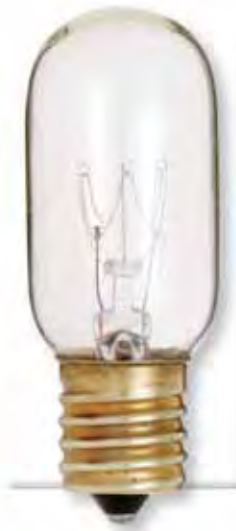
Appliance Bulb S3908 25 Watt Int. Base/130 Volt Dom. Code #25T8N