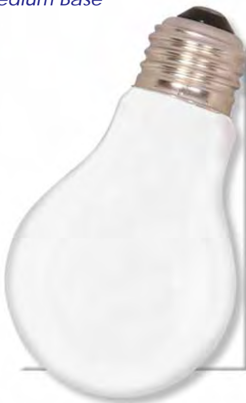
Energy Saver 130 Volt