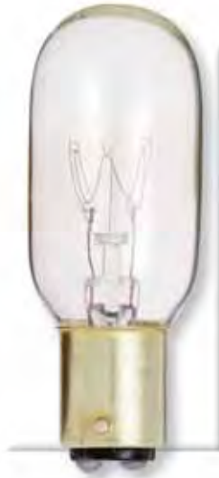
Indicator Bulb S3909 25 Watt D.C. Bay. Base/130 Volt Dom. Code #25T8DC