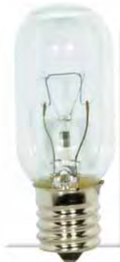
Microwave Bulb S3917 40 Watt Int. Base/130 Volt Dom. Code #40T8N Packing: 1/Card 120/Master, 12/Inner

Packing: 10 Pack Sleeve 120/Master, 10/Inner