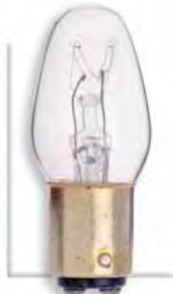
Appliance Bulb S3904 10 Watt D.C. Bay. Base 130 Volt Dom. Code #10C7DC