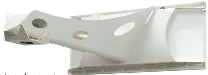
UNI-STA pictured without PDS-PLUSW