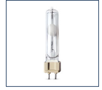
MASTER Colour CDM-T 250W