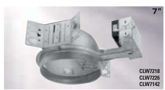
CLW7218 CLW7226 CLW7142

Lens wall wash utilizes compact fluorescent lamps and concave spread lens for uniform light distribution on vertical surfaces.