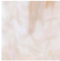
Textured Carmel Swirl Glass (CG)