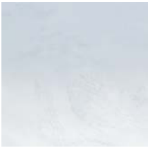
Textured Warm White Glass - (WG)