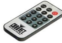
Wireless IR remote