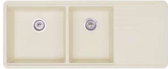
MODEL 221-070 Shown